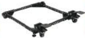
Stallion (500lb) Universal Mobile Base Reg. Price: From $74.95 Sale: $53.95