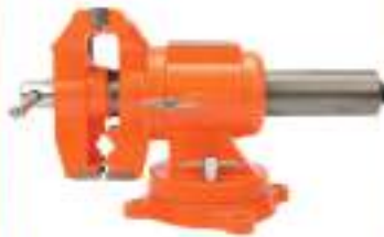
Pony 5" Multi-Purpose Swivel Bench Vise Reg. Price: $129.95 Sale: $124.95