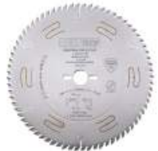
CMT Industrial Panel Saw Blades for Solid Wood