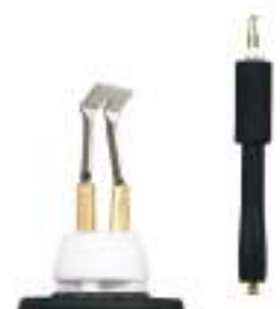
Razertip HD Medium Shading Chisel Pen Reg. Price: $36.95 Sale: $31.95