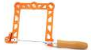
Whisky Jack Fret Saw (5" Deep Cut) Reg. $89.95