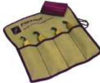
Flexcut Scorp Set