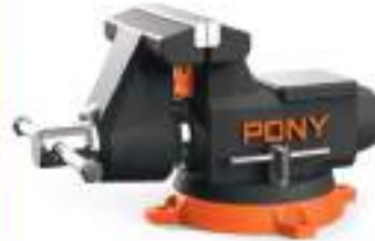
Pony 4" Commercial HD Swivel Bench Vise Reg. Price: $89.95 Sale: $79.95