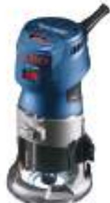
Bosch 1.25 HP VS Palm Router GKF125CE