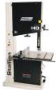
Stallion 24" 5.5 HP "HD" Series Band Saw