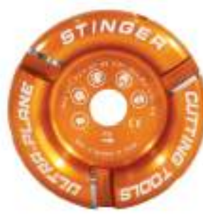
Stinger Ultra-Plane Carbide Wood Carving Disc w/ Case Reg. Price: $279.95 Sale: $249.95