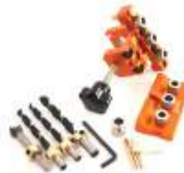
Whisky Jack Dowelling Jig Kit Reg. $69.95