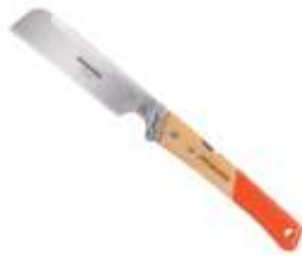
Jorgensen 6" Pro Dozuki Folding Dovetail Pull Saw