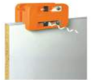
CMT Double Sided Edgeworking Trimmer