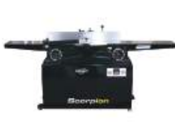
Scorpion 8" Helical Parallelogram Jointer