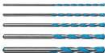
Fisch 5 PCE Carbide Tip Multi-Purpose Drill Bit Set