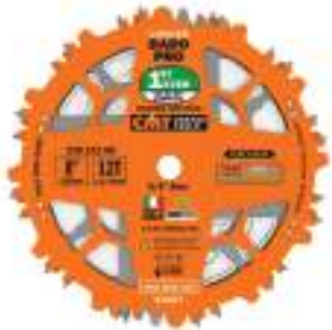
CMT 8" x 12T Locked Dado Pro Set