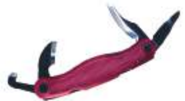
Flexcut Spoon Carvin' Jack 2.0 Multi-Tool