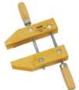
Wood Handscrew Clamp 6" Reg. Price: $15.95