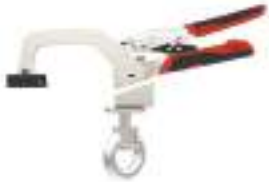
Armor 3" Auto-Adjust Drill Press Clamp Reg. Price: $62.95