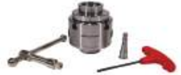
Rivolver 2.75" 4-Jaw Wood Lathe Chuck