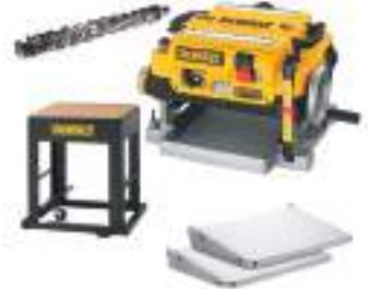
DeWalt DW735 Helical Planer Combo Kit