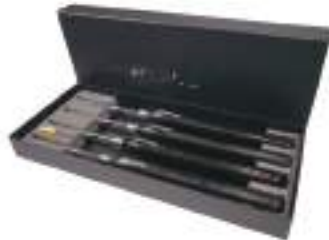
Rivolver 4 Piece Carbide Turning Tool Set w/12.5" Handle