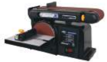
SandX 4" X 36" Belt & 6" Disc Sander