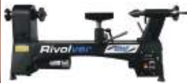
Rivolver 12" x 20" Vari-Speed Wood Lathe