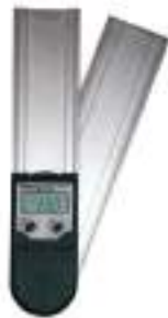
Wixey 8" Digital Protractor