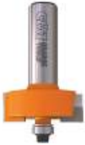
CMT Rabbeting Router Bit 835.850.11 (1/2D x 1/2H x 1/2S) Reg. Price: $43.95 Sale: $30.95