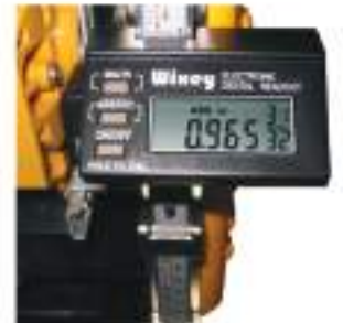
Wixey Portable Planer Digital Readout