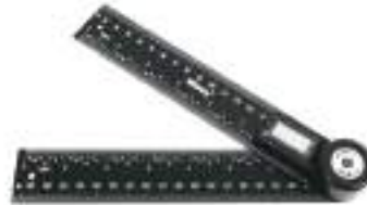
Wixey 8" Smart Protractor w/ Bluetooth