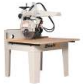
Stallion 16" Radial Arm Saw (3-Phase)