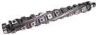
Stinger 4 Row 13" Carbide Helical Cutterhead (Fits DeWalt DW735)