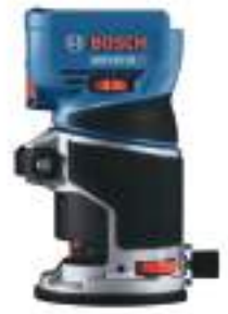
Bosch 18V Brushless Colt Palm Router GKF18V-25N