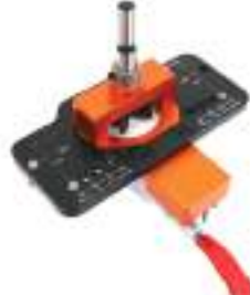
Whisky Jack Hinge Drilling Jig Reg. $119.95