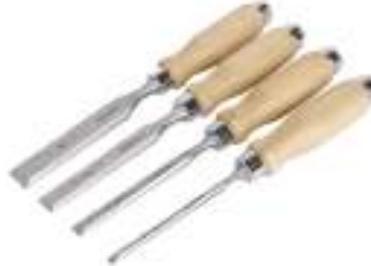
Jorgensen HSS 4-Piece Chisel Set