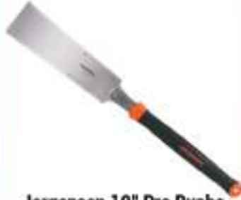
Jorgensen 10" Pro Ryoba Double Edge Pull Saw Reg. Price: $42.95 Sale: $28.95