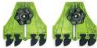
Bow Fence Pro Featherboard Kit (2/pk)