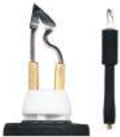
Razertip HD Medium Skew Pen Reg. Price: $36.95 Sale: $31.95