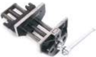
Beaver Quick Release 7" Bench Vise Reg. Price: $199.95 Sale: $179.95