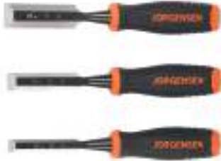
Jorgensen 3 Piece Chisel Set