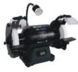
Rivolver 8" HD Slow Speed 1 HP Bench Grinder