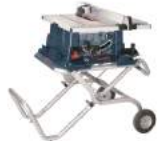
Bosch 10" Portable Table Saw with Gravity Rise Stand 4100XC-10