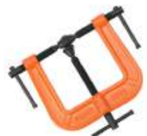
Pony 3 1/2" 3-Way Edge Clamp