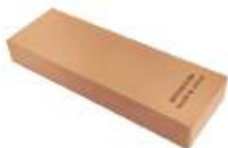
King #1000 Finishing Stone