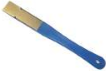
DMT D2C Mini Diamond Hone Reg. Price: $17.95 Sale: $8.95