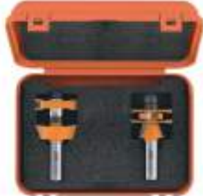
CMT Shaker Door Router Bit Set Reg. Price: $249.95