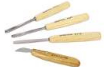
Pfeil 4 Piece Student Carving Tool Set