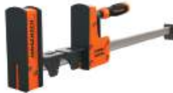
Jorgensen Pro Cabinet Master Clamp