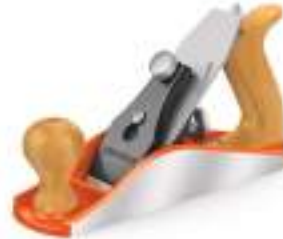
Jorgensen #4 Smoothing Plane