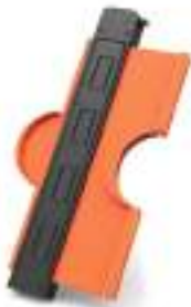
Whisky Jack 10" Contour Gauge