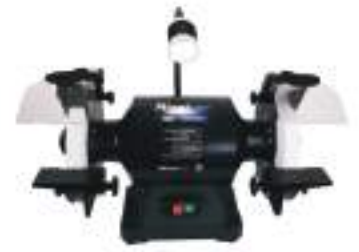
Rivolver 8" HD Slow Speed 1 HP Bench Grinder