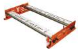
Whisky Jack Router Sled Milling Jig Reg. $199.95