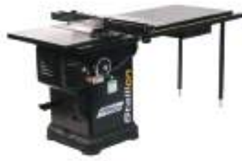
Stallion 3HP 10" Cabinet Saw w/52" Deluxe Fence