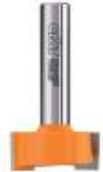
CMT Dado & Planer Router Bits