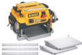
DeWalt 13" Planer c/w Ext. Tables and Extra Knives