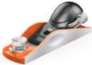
Jorgensen #60 1/2 Low Angle Block Plane