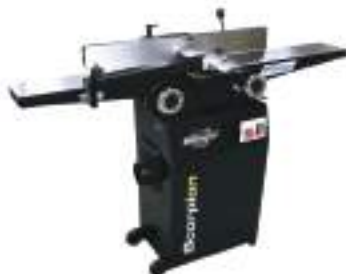
Scorpion Deluxe Helical 6" Jointer