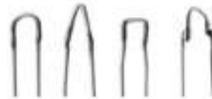
Razertip Medium Feather Former Reg. Price: $41.95 Sale: $37.95