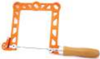
Whisky Jack Fret Saw (5" Deep Cut)