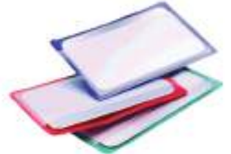
DMT D3EFC "Credit Card" Diamond Sharpener Reg. Price: $64.95 Sale: $38.95