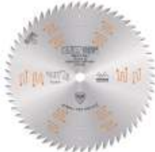
CMT Industrial Panel Saw Blades