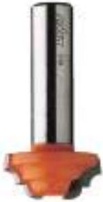
CMT Plunge Cut Ogee Router Bits