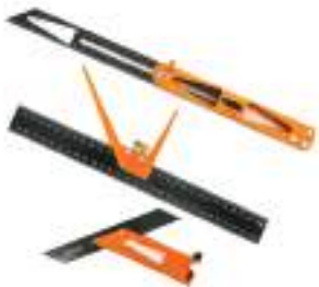
Whisky Jack Precision Square & Angle Tool Set Reg. $199.95