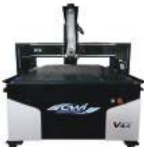
Basic V4.4 CNC Router 4' x 4'