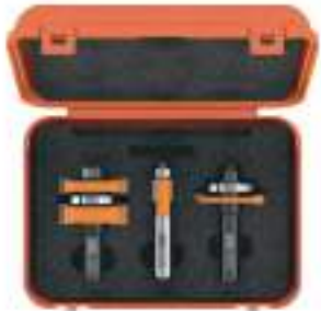
CMT Tongue & Groove Cabinetmaking Router Bit Set Reg. Price: $153.95