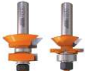
CMT Tongue & Groove V Panel Router Bit Set Reg. Price: $248.95