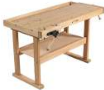
Beaver "Deluxe" Workbench c/w 2 Vises Reg. Price: $1,249.95 Sale: $1,199.95