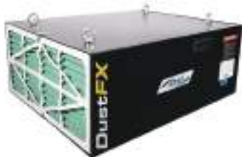
DustFX 1050 CFM Air Cleaner