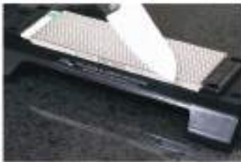
DMT "Duosharp Plus" 8" Double Sided Sharpening Kit Reg. Price: $199.95 Sale: $123.95