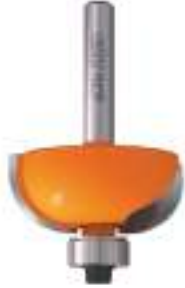
CMT Cove Router Bit 837.222.11 (1D x 1/2L x 1/4R x 1/4S) Reg. Price: $40.95 Sale: $28.95