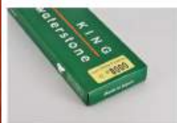
King #8000 Finishing Stone