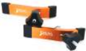
Whisky Jack 2-Piece Hold-Down Clamp Set Reg. $32.95