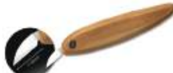
Flexcut 1" Pro Series Chip Carving Knife