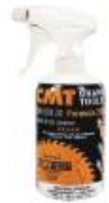
CMT Formula 2050 Blade & Router Bit Cleaner