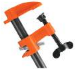
Pony 3/4" Reversible Deep Reach Pipe Clamp Set