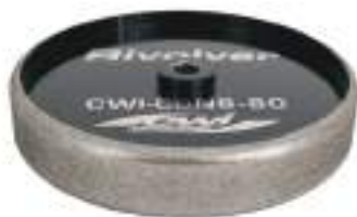
Rivolver 8" X 1.5" Radiused Edge CBN Grinding Wheel