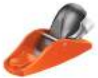
Jorgensen Mini Block Plane