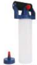
Whisky Jack Glue Roller Applicator