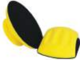
Whisky Jack 5' Hand Sanding Pad Kit