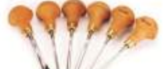
Pfeil "D" 6 PCS Detail Palm Chisel Set