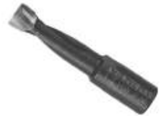
Festool 4mm Domino Cutter by CMT Reg. Price: $36.95 Sale: $23.95