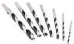
Fisch 7PCE HSS Brad Point Drill Bit Set