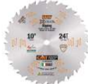
CMT "ITK" Industrial Thin Kerf Saw Blades Reg. Price From: $15.95 Sale: $14.95