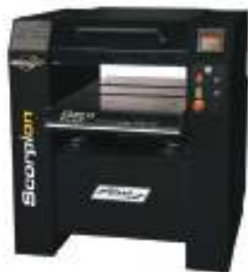
Scorpion 25" Vari-Speed 10 HP Helical Thickness Planer Reg. Price: $15,999.95