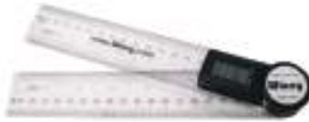
Wixey 8" Digital Protractor / Ruler