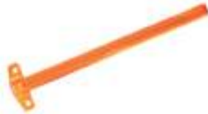
Whisky Jack 24" Scribing T-Square Reg. $69.95 Sale: $62.96