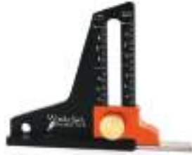
Whisky Jack Precision Height Gauge Reg. $34.95