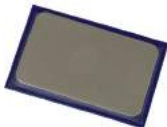
DMT D3C "Credit Card" Diamond Sharpener