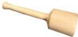
Pfeil Hornbeam 350g Carvers Mallet Reg. Price: $62.95 Sale: $48.95