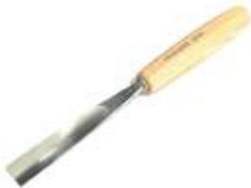
Pfeil 3/20 Straight Shallow Chisel Reg. Price: $57.95 Sale: $38.95