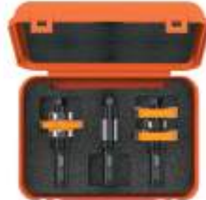
CMT Mission Door Router Bit Set Reg. Price: $189.95