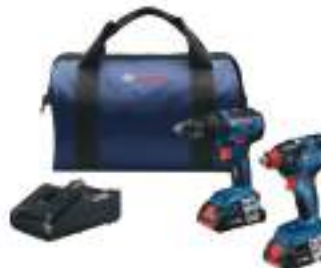
Bosch 18 Volt 1/2" Hammer Drill w/ Impact Driver Kit GXL18V-233B25