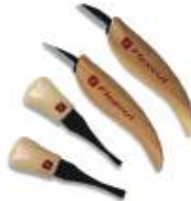
Flexcut Beginners Knife and Palm Set Reg. Price: $133.95 Sale: $120.95