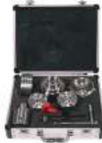
Rivolver 2.75" 4-Jaw Lathe Chuck & Jaws Kit