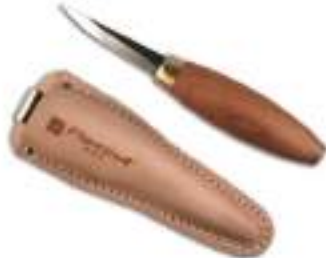
Flexcut Sloyd Knife