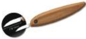
Flexcut 1-3/8" Pro Series Detail Knife