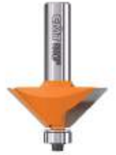
CMT Chamfer Router Bits