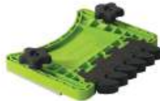
Bow Feather Pro Featherboard