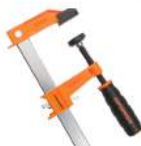
Jorgensen Heavy Duty Bar Clamp