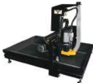
Professor V4.4 CNC Router 48" x 48"