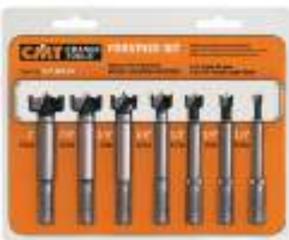
CMT 7 Piece Imperial Forstner Bit Set