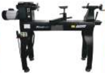
Rivolver 20" x 32" Vari-Speed Wood Lathe