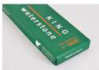
King #6000 Finishing Stone