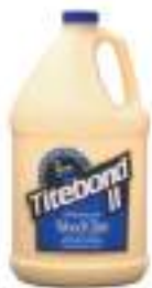
Titebond II Wood Glue Gallon Reg. Price: $56.95 Sale: $49.95