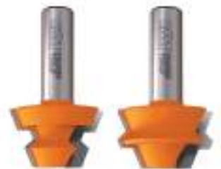
CMT Lock Miter Set 1/2" Shank Reg. Price: $183.95