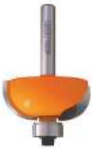
CMT Cove Router Bits