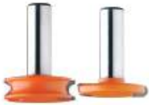
CMT Flute & Bead Router Bit Set for Canoes & Hot Tubs Reg. Price: $121.95 Sale: $86.95