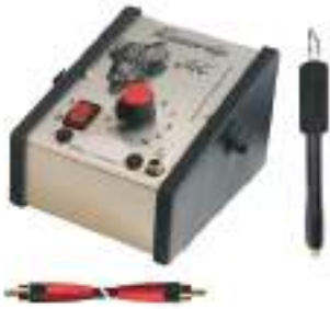
Razertip SK Wood Burner c/w Fixed Tip Pen Reg. Price: $176.95 Sale: $158.95