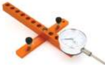
Whisky Jack Machinery Alignment Tool