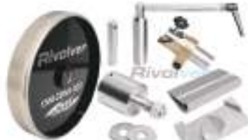
Rivolver CBN Wheel Sharpening Kit w. 220 Grit CBN Wheel 1" x 8 TPI