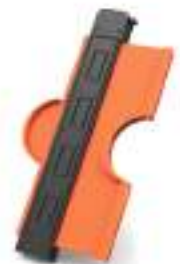
Whisky Jack 10' Contour Gauge