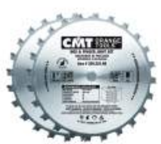
CMT Box & Finger Joint Blade Set Reg. Price: $128.95 Sale: $116.95