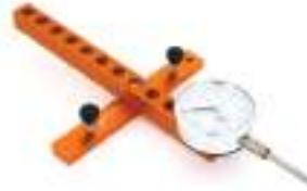
Whisky Jack Machinery Alignment Tool Reg. $69.95