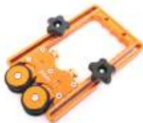
Whisky Jack Table Saw Safety Roller Guide Reg. $89.95