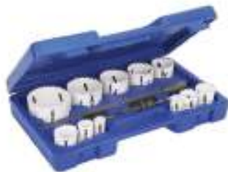
Bi-Metal Hole Saw Set 15 PC