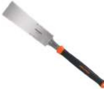
Jorgensen 10" Pro Ryoba Double Edge Pull Saw