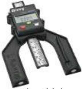
Wixey Digital Height Gauge