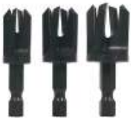
Fisch 3 Pce Tapered Plug Cutter Set 3/8\", 1/2\", 5/8\"