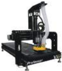
Professor V2.4 CNC Router 24" x 51"