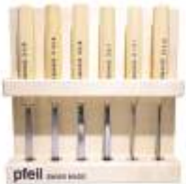
Pfeil 6 Piece Student Carving Tool Set