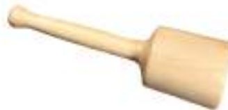
Pfeil Hornbeam 450g Carvers Mallet Reg. Price: $79.95 Sale: $54.95