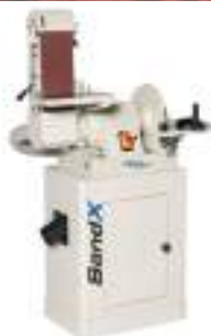
SandX Deluxe 6" x 12" Belt & Disc Sander Reg. Price: $1,729.95