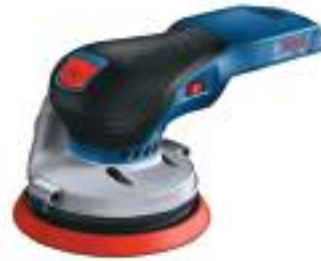
Bosch 18 Volt 5" Brushless Random Orbit Sander GEX18V-5N