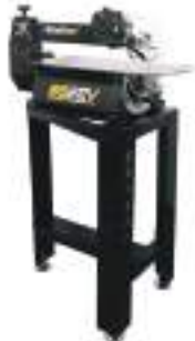
Stallion 22" Vari-Speed Scroll Saw & Stand