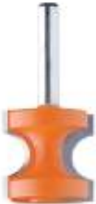
CMT Bull Nose Router Bits