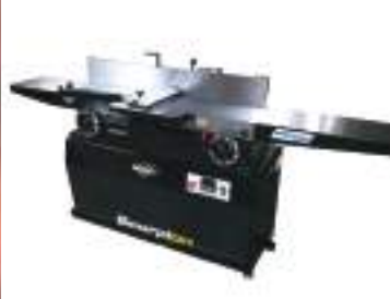
Scorpion 12" Parallelogram Helical Jointer