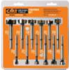
CMT 12 Piece Metric Forstner Set