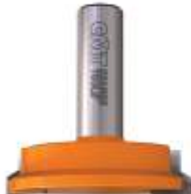
CMT Drawer Lock Router Bits