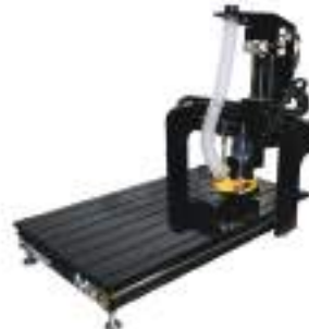
Professor M2.3 CNC Router 24" x 36"