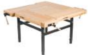
Beaver "Quad HD" Classroom Workbench c/w 4 Vises and Adj. Steel Legs Reg. Price: $2,599.95 Sale: $2,479.95