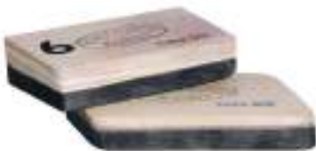
Pfeil Belgian Clay Wet Stone Reg. Price: $92.95 Sale: $52.95