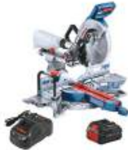
Bosch 18 Volt Cordless 10" Slide Miter Saw Kit GCM18V-10SDN14