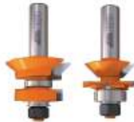
CMT Tongue & Groove V Panel Router Bit Set Reg. Price: $248.95 Sale: $175.95