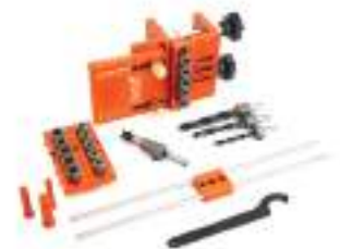
Whisky Jack Deluxe Self Centering Dowelling Jig Kit Reg. $229.95