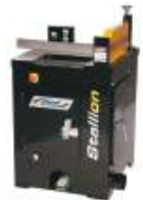
Stallion 18" Pneumatic Undercut Saw