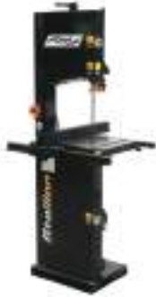
Stallion Deluxe 14" Band Saw 1.75 HP Reg. Price: $1,999.95 Sale: $1,399.95

*LIMITED STOCK. NOT AVAILABLE IN ALL STORES. SHIPPING CHARGES MAY APPLY*