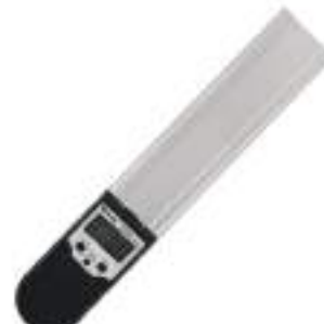
Wixey 12" Digital Protractor w/ Mitre Set