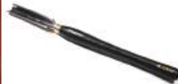
Rivolver M42 Cryo 1 1/4" Roughing Gouge