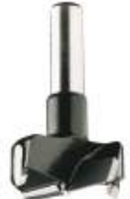
CMT Carbide Hinge Boring Bits