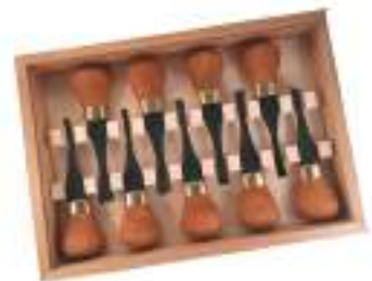
Flexcut Premium Palm Chisel Set w/ Cherry Handles Reg. Price: $307.95 Sale: $276.95