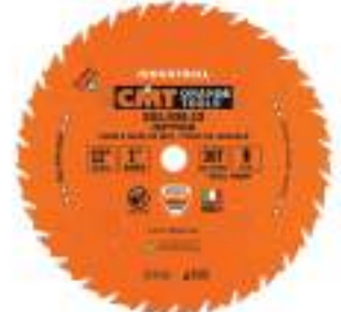
CMT Carbide Rip Saw Blades Reg. Price From: $80.95 Sale: $73.95