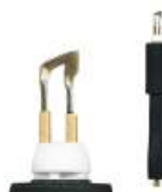
Razertip HD Med 45 Deg Shading Tip Pen Reg. Price: $36.95 Sale: $31.95