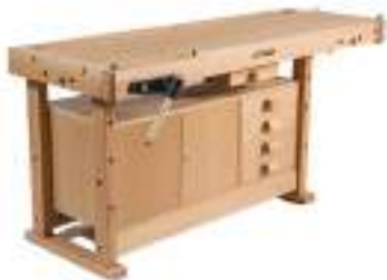
Beaver "Premium Plus" Workbench c/w 2 Vises Reg. Price: $2,499.95 Sale: $2,299.95