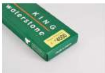
King #4000 Finishing Stone