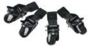
Beaver Workbench Mobility Kit Reg. Price: $99.95 Sale: $53.95