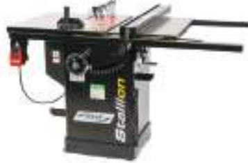
Stallion 1.5 HP 10" Cabinet Saw