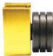
Stallion Band Saw Scrolling Blade Guide Reg. Price: From $59.95 Sale: $29.95