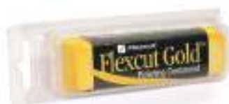
Flexcut "Gold" Polishing Compound