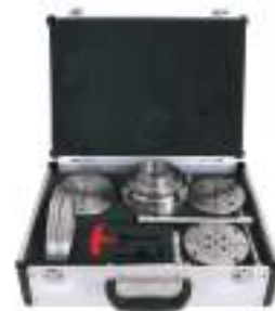
Rivolver HD 4.5" 4-Jaw Lathe Chuck & Jaw Kit