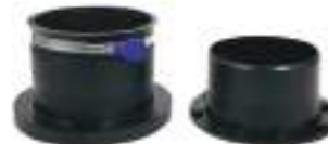
DustFX 4" Magnetic Quick Connect Kit