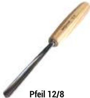
Pfeil 12/8 V-Parting Chisel Reg. Price: $54.95 Sale: $40.95