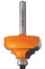
CMT Classical Ogee Router Bits