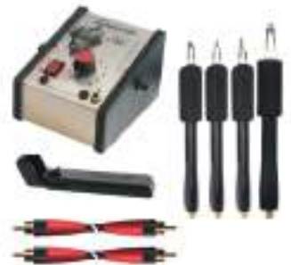
Razertip Pyrography Starter Burner Kit c/w 4 Pens, 2 Cords & Tip Cleaner Reg. Price: $293.95 Sale: $264.95