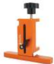
Whisky Jack Cabinet Door Installation Jig Reg. $42.95