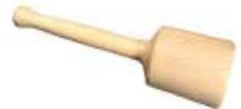
Pfeil Hornbeam 600g Carvers Mallet Reg. Price: $79.95 Sale: $55.95

*LIMITED STOCK. NOT AVAILABLE IN ALL STORES. SHIPPING CHARGES MAY APPLY*