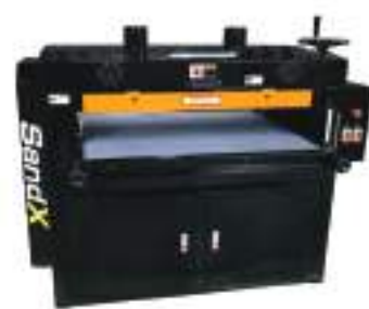
SandX 37" HD Double Drum Sander Reg. Price: $8,999.95