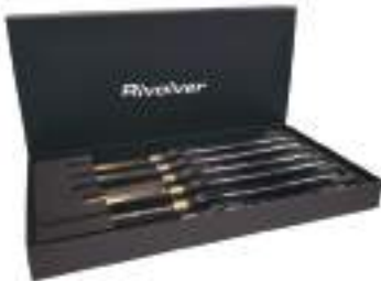
Rivolver 6 Piece M42 Cryo Turning Tool Set