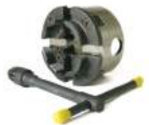
OneWay Talon Chuck (Adapter Extra) Reg. Price: $247.95 Sale: $210.95

*LIMITED STOCK. NOT AVAILABLE IN ALL STORES. SHIPPING CHARGES MAY APPLY*