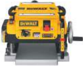
DeWalt 13" Thickness Planer