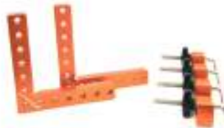
Whisky Jack 5-1/2" Corner Clamping Kit (2/Kit) Reg. Price: $69.95