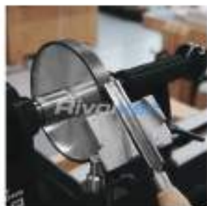
Rivolver CBN Wheel Sharpening Jig for Wood Lathes