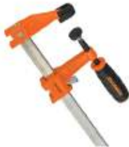
Jorgensen Bar Clamp