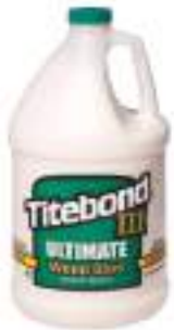
Titebond III Wood Glue Gallon Reg. Price: $79.95 Sale: $59.95