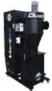
DustFX 3 HP Vortex Cyclone Dust Collector Reg. Price: $7,299.95