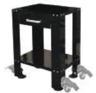
Multi-Purpose Bench-Top Machinery Stand