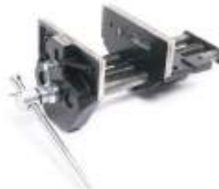
Beaver Quick Release 9" Bench Vise Reg. Price: $249.95 Sale: $229.95