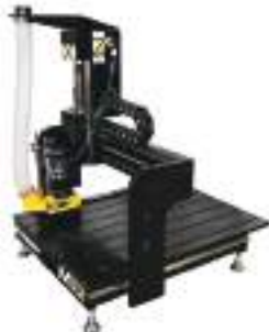
Professor M2.2 CNC Router 24" x 24"