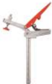
Armor Auto-Adjust Hold Down Bench Dog Clamp Reg. Price: $70.95