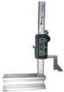
Wixey Digital Height Gauge