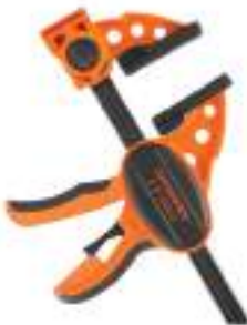
Jorgensen ISD 3 Spreader Clamp