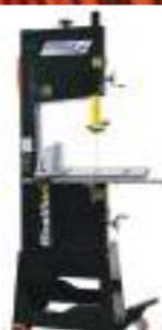
Stallion 14" 1.5 HP Band Saw Reg. Price: $1,399.95