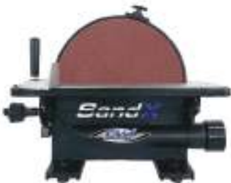
SandX 12" Bench Top Disc Sander