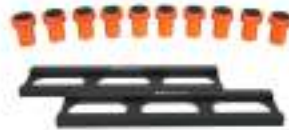
Whisky Jack Bench Dog Fence Kit Reg. $89.95