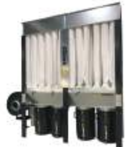
DustFX Max-5000 Dust Collector