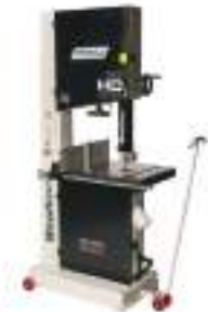
Stallion 20" 4HP HD Series Band Saw