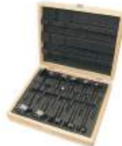
Fisch 16pc Black Shark Forstner Bit Set, Imperial