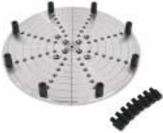
Rivolver 10" Flat Jaws Set