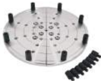
Rivolver 8" Flat Jaws Set (For WLC3.75)