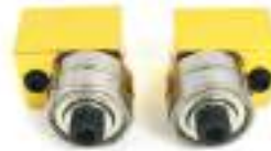
Stallion Upper Ball Bearing Guide Set Reg. Price: $44.95 Sale: $39.95