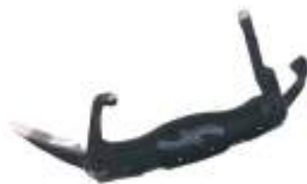
Flexcut Pocket Jack 2.0 Folding Multi-Tool