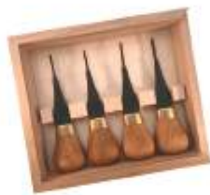
Flexcut Premium Micro-Palm Chisel Set w/ Cherry Handles Reg. Price: $181.95 Sale: $162.95