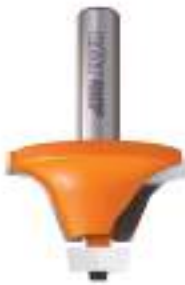
CMT Solid Surface Rounding Over Bowl Router Bit Reg. Price: $105.95 Sale: $66.95