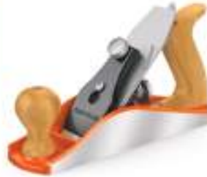
Jorgensen #4 Smoothing Plane Reg. Price: $109.95 Sale: $72.95