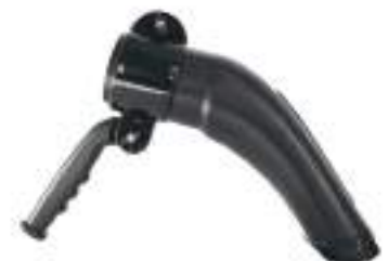
DustFX 4" Handheld Vacuum Brush