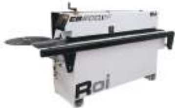
Roi "EU" Series Pre-Milling 3mm Edgebander Reg. Price: $29,999.95