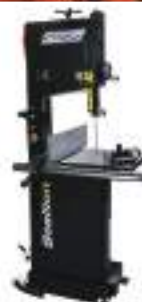
Stallion 14" XS Series Band Saw Reg. Price From: $2,149.95