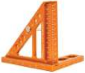
Whisky Jack Precision Angle & Marking Square Reg. $39.95