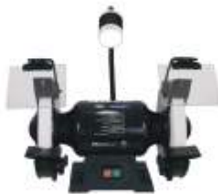
Rivolver 8" Slow Speed 1/2 HP Bench Grinder