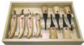
Flexcut Deluxe Palm and Knife Set Reg. Price: $311.95 Sale: $280.95