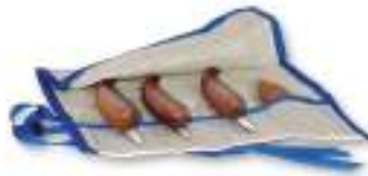
Pfeil 4 Piece Schaller Carving Knife Set