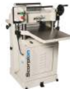
Scorpion 15" 3 HP Helical Thickness Planer