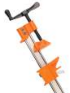
Jorgensen I-Beam Clamp