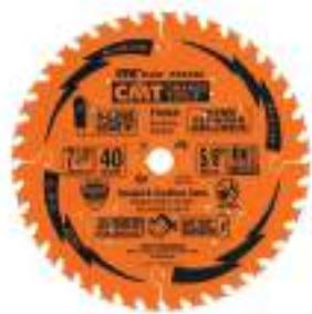
CMT ITK-Plus V-Drive Finish 7-1/4"x T40 Reg. Price: $23.95 Sale: $19.95