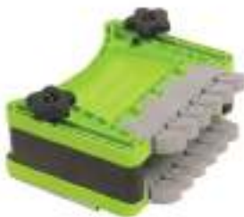
Bow Feather Pro Dual-Stack Featherboard Kit