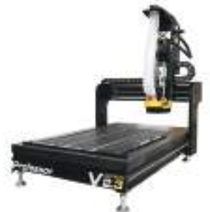
Professor V2.3 CNC Router 24" x 36"