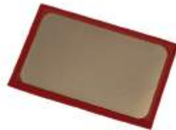
DMT D3F "Credit Card" Diamond Sharpener