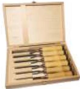
Pfeil 6 pc. Carpenter's Bench Chisel Set