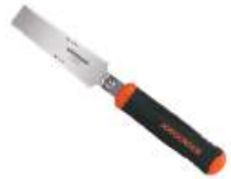
Jorgensen 5" Pro Double Edge Flush Cut Saw