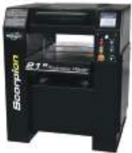
Scorpion 21" Vari-Speed 7.5 HP Helical Thickness Planer Reg. Price: $10,999.95