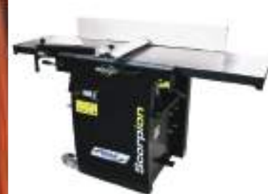
Scorpion 16" 4 HP Helical Jointer/Planer