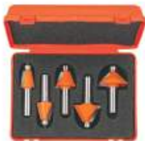
CMT 5 Piece Chamfer Router Bit Set Reg. Price: $212.95