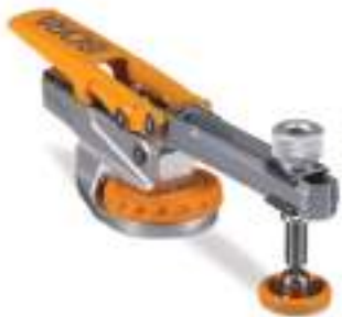
Bora Auto-Adjust Hold Down T-Track Clamp Reg. Price: $56.95