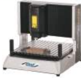
Prodigy CNC Engraving Machine Reg. Price: $3,799.95 Sale: $1,999.95