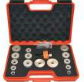
CMT Grand Rabbeting Router Bit Set Reg. Price: $199.95