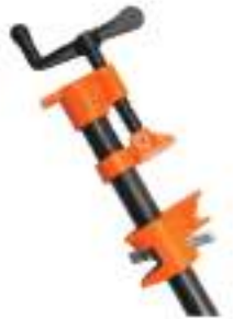
Pony 3/4" Pipe Clamp Set