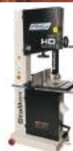
Stallion 16" 4HP HD Series Band Saw Reg. Price: $2,999.95