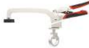
Armor 6" Auto-Adjust Drill Press Clamp Reg. Price: $66.95