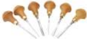
Pfeil "B" 6 PCS Detail Palm Chisel Set