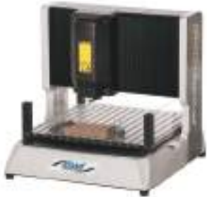
Prodigy CNC 12"x12" Engraving Machine