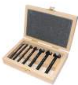
Fisch 7pc Wave Cutter Forstner Bit Set, Imperial