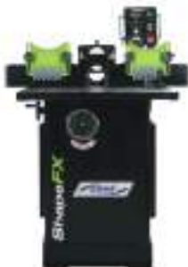
ShapeFX Variable Speed 3HP Router/Shaper Reg. Price: $4,499.95