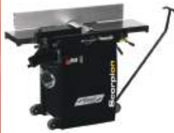
Scorpion 12" 3 HP Helical Jointer/Planer