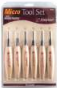
Flexcut Micro Tool 1.5mm Chisel Set