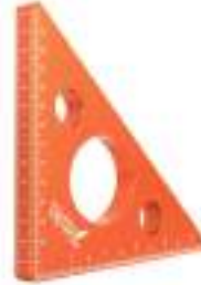
Whisky Jack 5 1/2" M/E Triangle Set Up Square Reg. $19.95 Sale: $44.96