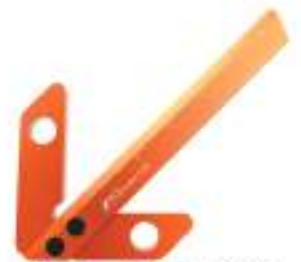
Whisky Jack 8' 45/90° Square&Center Finder