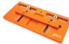
Whisky Jack Drawer Pull Drilling Jig Reg. $59.95