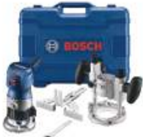
Bosch 1.25 HP VS Palm Router Kit GKF125CEPK