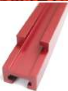
Armor Double Sided T-Track (Multiple Lengths Available) Reg. Price: From $38.95 Sale: $24.95