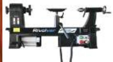
Rivolver 14" x 20" Vari-Speed Wood Lathe (220v)