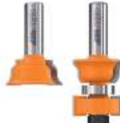
CMT Window Sash Router Bit Set 1/2" Shank Reg. Price: $196.95