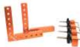
Whisky Jack 5-1/2' Corner Clamping Kit