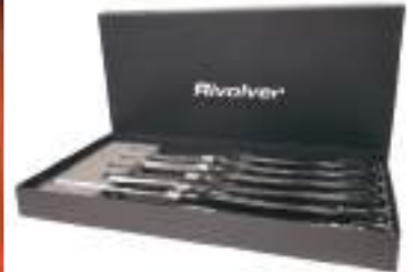
Rivolver 6 Piece M2 Cryo Turning Tool Set