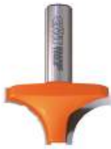
CMT Ovolo Router Bits