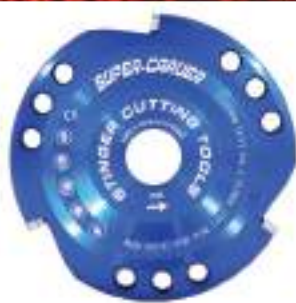
Stinger Super-Carver Carbide Wood Shaping Disc w/ Case Reg. Price: $234.95 Sale: $214.95