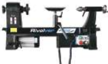
Rivolver 14" x 20" Vari-Speed Wood Lathe (110v)