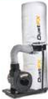
DustFX 1HP Dust Collector Reg. Price: $699.95 Sale: $399.95