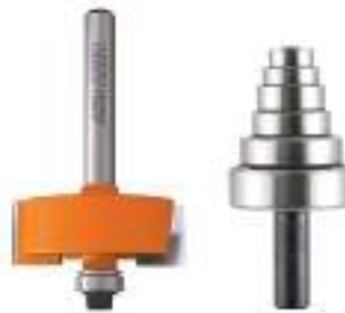
CMT Rabbeting Router Bit Sets