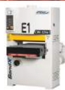
SandX 25" x 60" 7.5 HP Wide Belt Sander (Single Phase) Reg. Price: $22,999.95