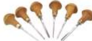
Pfeil "C" 6 PCS Detail Palm Chisel Set