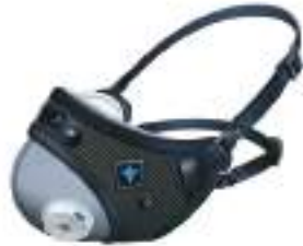
RZ RZM3 Dust Mask FFP2 Deluxe