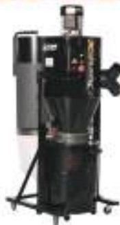
DustFX 2 HP Hepa Cyclone Dust Collector Reg. Price: $3,199.95 Sale: $2,199.95