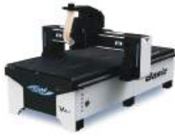
Basic V4.8 CNC Router 4' x 8'