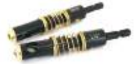
Whisky Jack Self Centering Drill Bit Set Reg. $19.95