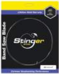
Stinger High Performance Bandsaw Blades Reg. Price From: $25.95 Sale: $21.95