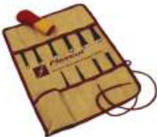
Flexcut Deluxe Craft Carving Set Reg. Price: $186.95 Sale: $168.95