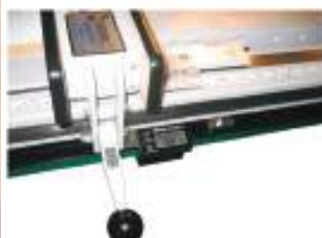
Wixey Table Saw Digital Fence Readout