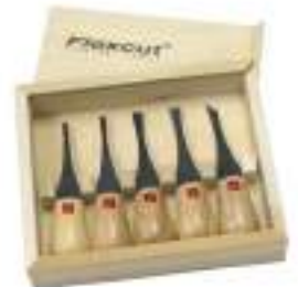
Flexcut Beginners Palm Knife Set Reg. Price: $150.95 Sale: $135.95