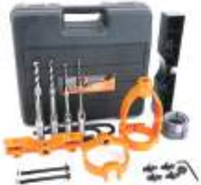
Whisky Jack Drill Press Mortising Jig Reg. $130.95