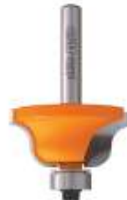
CMT Roman Ogee Router Bits