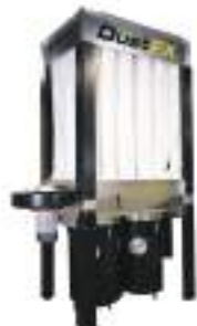
DustFX Midimax:CNC Dust Collector