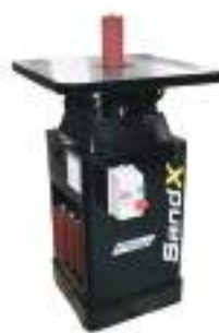
SandX Floor Model Oscillating Spindle Sander Reg. Price: $2,599.95