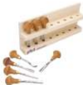
Pfeil "A" 8 PCS Large Size Palm Chisel Set