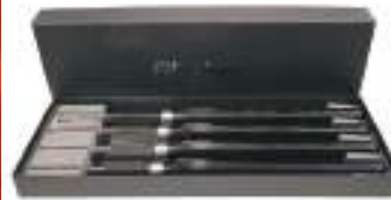
Rivolver 4 Piece Carbide Turning Tool Set w/15" Handle