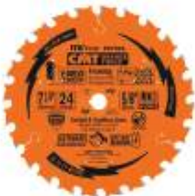
CMT ITK-Plus V-Drive Framing 7-1/4"x T24 Reg. Price: $17.95 Sale: $14.95