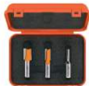
CMT Plywood Router Bit Set 1/4" Shank Reg. Price: $74.95