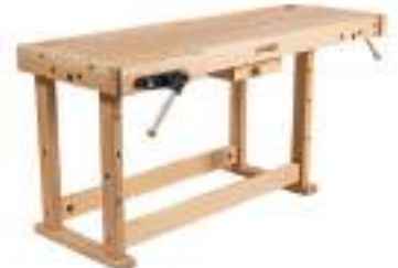
Beaver "Premium" Workbench c/w 2 Vises Reg. Price: $1,799.95 Sale: $1,699.95