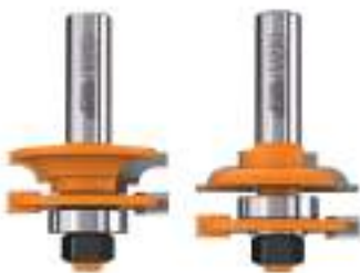
CMT Stile and Rail Router Bit Set - Cove/Bead Reg. Price: $179.95