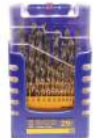
Fisch 29 PCE High-Speed Steel Brad Point Drill Bit Set