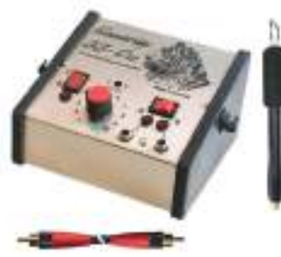
Razertip Deluxe Dual Pen Wood Burner c/w One F1L Pen Reg. Price: $216.95 Sale: $191.95