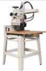
Stallion 12" Radial Arm Saw