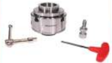
Rivolver 3.75" Precision Wood Lathe Chuck w/ Wrench