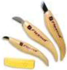
Flexcut 3 PC Chip Carving Set Reg. Price: $106.95 Sale: $96.95