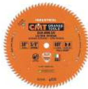
CMT \"Orange Chrome\" Industrial Melamine Blades