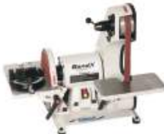
SandX 1" x 42" Bench Top Belt & Disc Sander