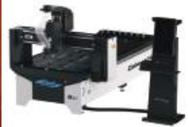
CabinetMaker Q4.9 CNC Router 4' x 9' w/Becker Vac Pump