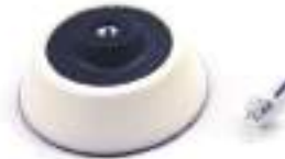
Whisky Jack 3' Soft Sanding Pad