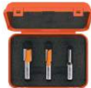
CMT Plywood Router Bit Set 1/2" Shank Reg. Price: $82.95