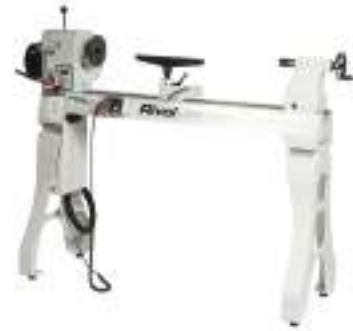
Rivolver 16" X 42" Vari-Speed Wood Lathe Reg. Price: $3,799.95 Sale: $2,499.95