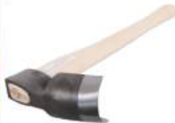
Pfeil Curved Adz 18" Handle