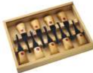
Flexcut Deluxe Palm Carving Set Reg. Price: $280.95 Sale: $252.95