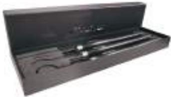
Rivolver 3 Piece Carbide Hollowing Tool Set