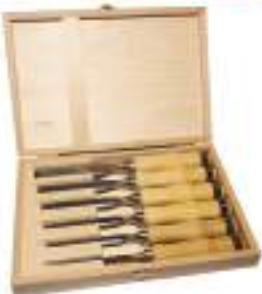
Pfeil 6 pc. Carpenter's Bench Chisel Set