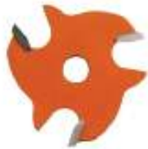
CMT 3-Flute Slot Cutters