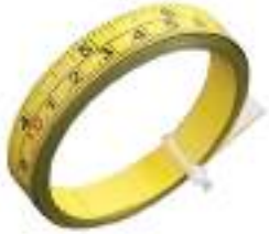
Whisky Jack 16' Self Adhesive Steel Ruler L/R