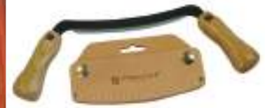
Flexcut 5" Draw Knife