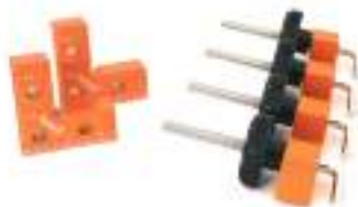
Whisky Jack 2 3/8" Mini Corner Clamping Kit (2/Kit) Reg. Price: $42.95