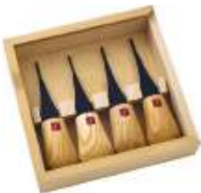
Flexcut Micro-Palm Carving Set Reg. Price: $134.95 Sale: $121.95