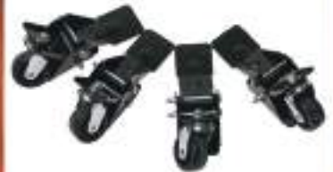
Beaver Workbench Mobility Kit Reg. Price: $69.95 Sale: $53.95