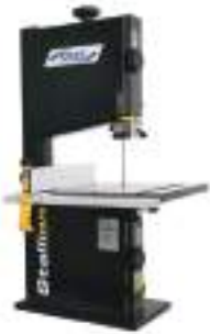
Stallion 10" Bench-Top Band Saw