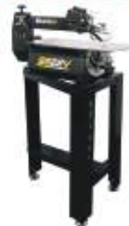
Stallion 22" Vari-Speed Scroll Saw & Stand Reg. Price: $899.95 Sale: $739.95