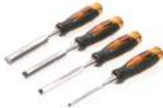
Jorgensen 4 Piece Chisel Set