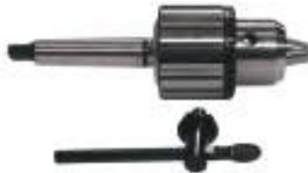
Rivolver 5/8" Keyed Drill Chuck w/MT2 Taper