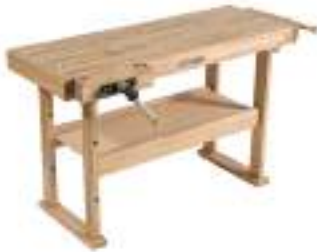
Beaver "Hobby" Workbench c/w 2 Vises Reg. Price: $724.95 Sale: $599.95