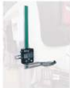
Wixey Drill Press Depth Gauge