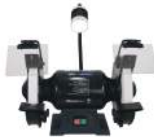
Rivolver 8" Slow Speed 1/2 HP Bench Grinder