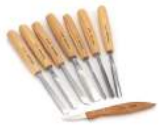
Pfeil 8 PCS Starter Full Size Carving Tool Set