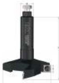
CMT CNC Spoilboard Cutters