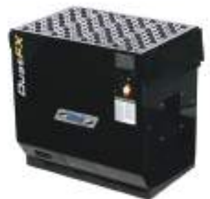
DustFX Floor Model Down Draft Table