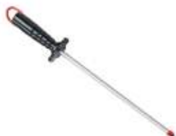
Diamond Sharpening Steel