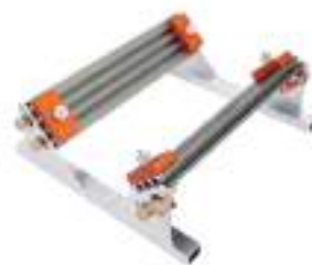
Whisky Jack Spline Cutting Jig Reg. $189.95