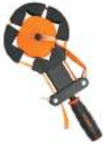
Pony Band Clamp