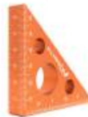
Whisky Jack 2 1/2' M/E Triangle Set Up Square