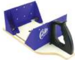
Carter Accuright Miter Mill