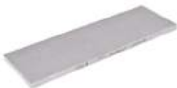
DMT 6" Double Sided Diamond Sharpening Stone