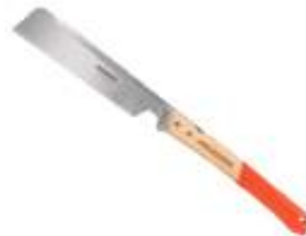
Jorgensen 9.5" Pro Dozuki Folding Dovetail Pull Saw