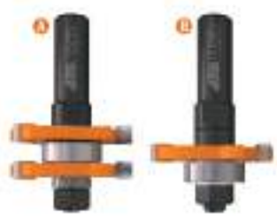
CMT Tongue & Groove Router Bit Set Reg. Price: $109.95