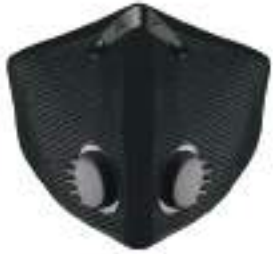
RZ Mesh Dust Mask with Active Carbon Filtration