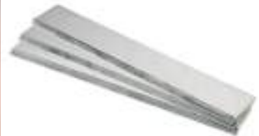
CMT HSS Jointer and Planer Knives