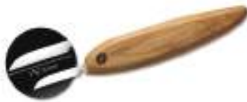
Flexcut 1-5/8" Pro Series Carving Knife