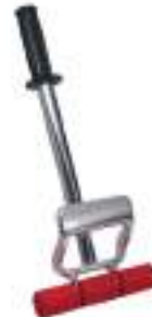
Heavy Duty Press Roller