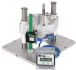
Wixey Remote Digital Readout for Router Tables