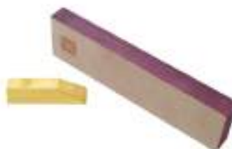
Flexcut Knife Strop w/Polish