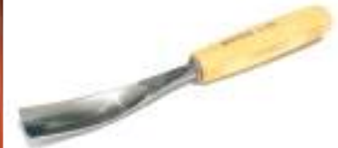
Pfeil 7L/30 Long Bent Gouge Reg. Price: $81.95 Sale: $60.95