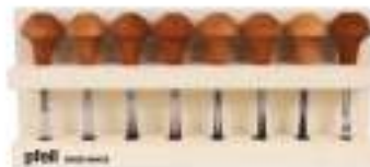
Pfeil "B" 8 PCS Large Size Palm Chisel Set