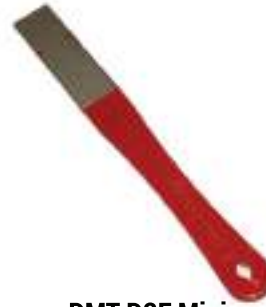
DMT D2F Mini Diamond Hone Reg. Price: $17.95 Sale: $8.95