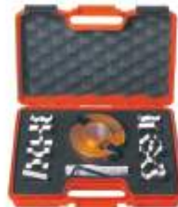
CMT Multi Profile Shaper Cutter Set