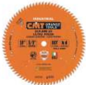
CMT Melamine/Fine Cut Carbide Saw Blades Reg. Price From: $102.95 Sale: $93.95