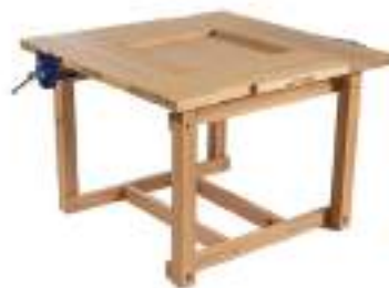
Beaver "Quad" Classroom Workbench (Vises Extra) Reg. Price: $1,249.95 Sale: $1,199.95