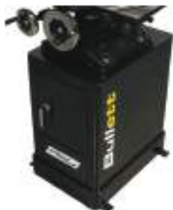
Bullett Mortiser Stand