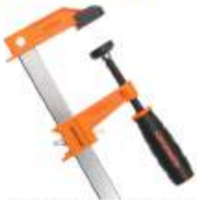
Jorgensen 6" Heavy Duty Bar Clamp Reg. Price: $21.95 Sale: $18.95