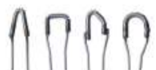
Razertip X-Coarse Feather Formers HD Reg. Price: $41.95 Sale: $37.95