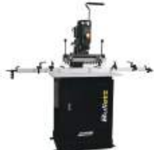
Bullett 13 Spindle Line Boring Machine