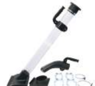
DustFX 4" Magnetic Vacuum Wand Kit