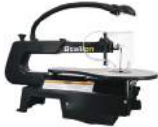
Stallion 16" Variable Speed Scroll Saw