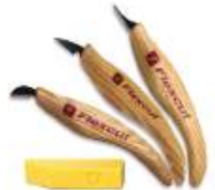
Flexcut Detail Knife Set Reg. Price: $122.95 Sale: $110.95