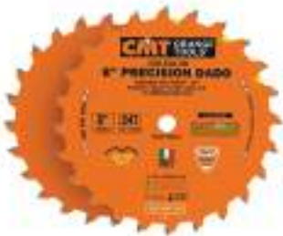
CMT High Precision Carbide Dado Set