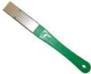
DMT D2E Mini Diamond Hone Reg. Price: $17.95 Sale: $8.95