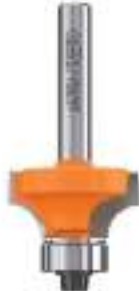
CMT Corner Roundover Router Bits