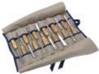
Pfeil 12 PCS Starter Full Size Carving Tool Set