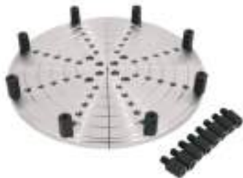
Rivolver 8" Flat Jaws Set (For WLC2.75)