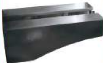
Rivolver 18" Bed Extension for WL825 Lathe