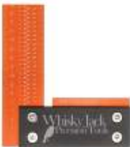
Whisky Jack Mini T-Square