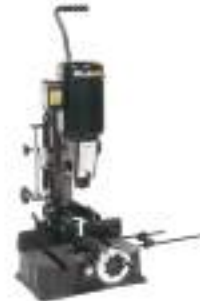
Bullett 5/8" Tilt Head Mortiser