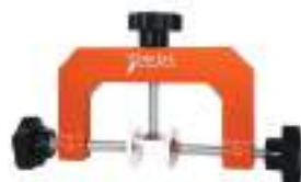
Whisky Jack 3-Way Cabinet Clamp Reg. $29.95