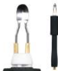
Razertip HD Medium Spoon Shader Reg. Price: $36.95 Sale: $31.95