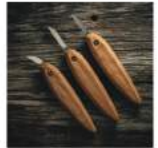
Flexcut Pro Series 3-Pack Full Sized Handle