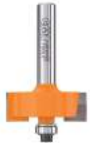
CMT CMT Rabbeting Bit 835.350.11 (1/2D x 1/2L x 1/4S) Reg. Price: $42.95 Sale: $28.95

*LIMITED STOCK. NOT AVAILABLE IN ALL STORES. SHIPPING CHARGES MAY APPLY*