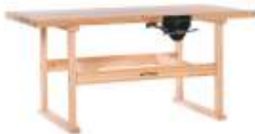
Beaver Classroom Workbench (Vises Extra) Reg. Price: $1,249.95 Sale: $1,199.95