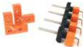
Whisky Jack 2 3/8' Mini Corner Clamping Kit