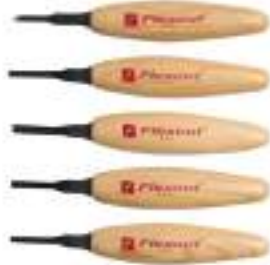
Flexcut Micro Tool 3mm 5 Piece Chisel Set