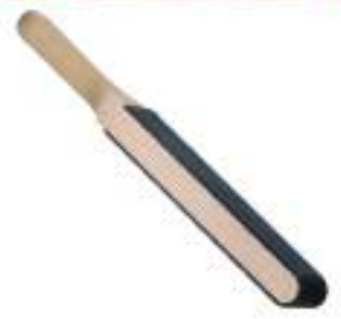
Pfeil Two Sided 12" Leather Strop