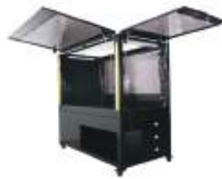
Professor 24" CNC Safety Enclosure and Stand Kit