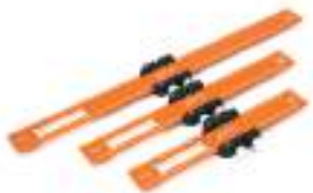
Whisky Jack 3 Piece Pocket Rule Set W/Stops Reg. $19.95 Sale: $45.95