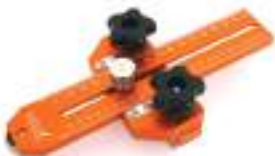
Whisky Jack Thin Rip Table Saw Jig Reg. $69.95