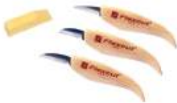
Flexcut 3-Knife Starter Set Reg. Price: $101.95 Sale: $91.95