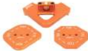
Whisky Jack Corner Radius And Bevel Marking Jig