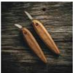
Flexcut Pro Series 2-Pack Knife Set - Small/Slim Handle