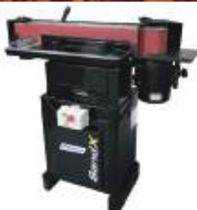
SandX 6" X 89" Extreme Oscillating Edge Sander Reg. Price: $2,599.95