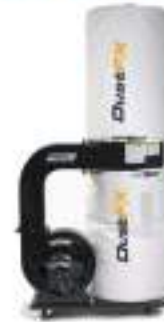
DustFX 2 HP Dust Collector Reg. Price: $999.95 Sale: $749.95