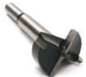
Fisch 35mm Premium Carbide Forstner Bit