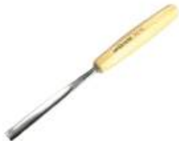
Pfeil 7/10 Straight Gouge Reg. Price: $49.95 Sale: $33.95