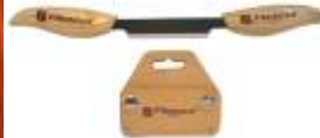
Flexcut 3" Draw Knife