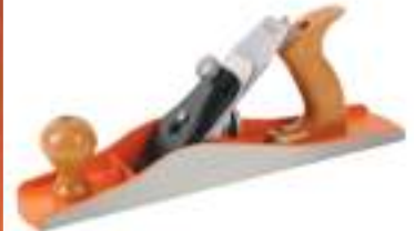
Jorgensen #5 Smoothing Jack Plane