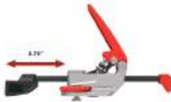
Armor Auto-Adjust In-Line Push T-Track Clamp Reg. Price: $56.95