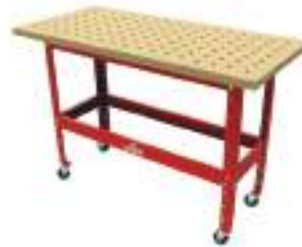
Armor 54"x25" Mobile Assembly Table w/ Casters Reg. Price: $882.95 Sale: $748.95