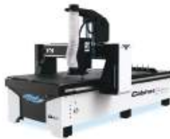
CabinetMaker Q4.8 CNC Router 4' x 8' w/Becker Vac Pump