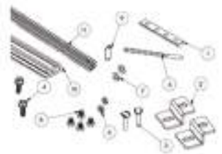
Wixey 7002 - Track Extension Kit (WR700, WR510)