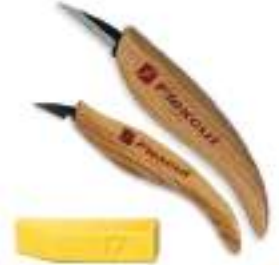
Flexcut Whittlers Kit