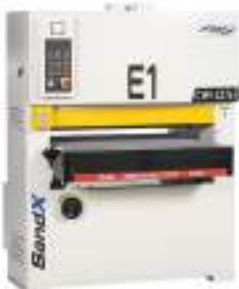
SandX 37" x 60" 10 HP Wide Belt Sander (Single Phase) Reg. Price: $27,599.95