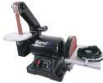
SandX Variable Speed 1" X 30" Belt & 6" Disc Sander