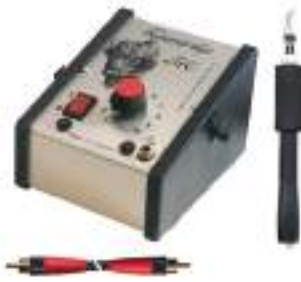
Razertip SK Burner c/w HD Interchangeable Tip Pen Reg. Price: $186.95 Sale: $167.95