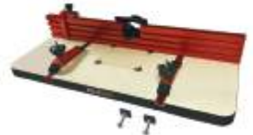
Bullett Drill Press Table w. Flip Stop & Hold Down Clamps