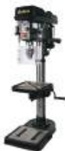
Bullett 13" Bench Model Vari-Speed Drill Press