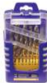
Fisch 25 PCE Metric High-Speed Steel Brad Point Drill Bit Set