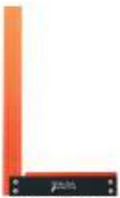
Whisky Jack 12' Scribing Square