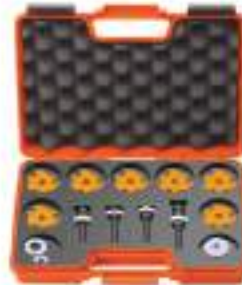
CMT 14 Pce Slot Cutting Set 1/2\"