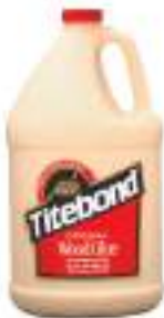
Titebond Wood Glue Original Gallon Reg. Price: $42.95 Sale: $37.95