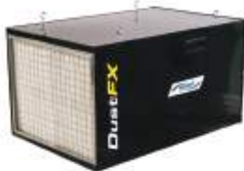
DustFX 1400 CFM Air Cleaner