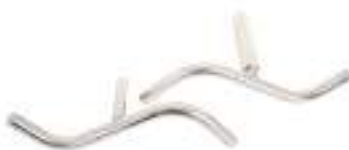
Rivolver Stainless Steel Curved Tool Rest Set