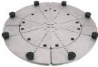
Rivolver 15" Jumbo Jaws Set