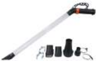
DustFX 2.5" Vacuum Wand Kit