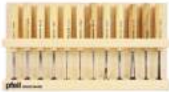
Pfeil 12 PCS Student Carving Tool Set