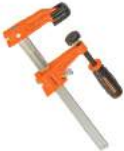
Jorgensen Light Duty Bar Clamp