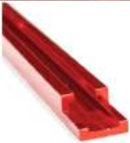
Armor Single Quick T-Track (Multiple Lengths Available) Reg. Price: From $21.95 Sale: $18.95