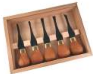
Flexcut Premium 5 Piece Palm Chisel Set w/ Cherry Handles Reg. Price: From $169.95 Sale: $152.95