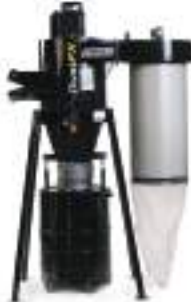
DustFX 5HP Auto-Clean Cyclone Dust Collector (1-Phase) Reg. Price: $5,999.95