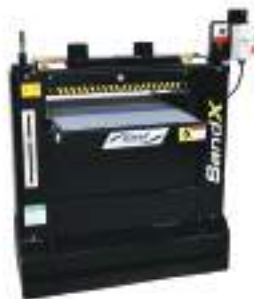
SandX 25" Double Drum Sander Reg. Price: $3,799.95