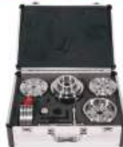
Rivolver 3.75" 4-Jaw Lathe Chuck & Jaw Set