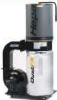
DustFX 2 HP Hepa Dust Collector Reg. Price: $1,599.95 Sale: $1,199.95