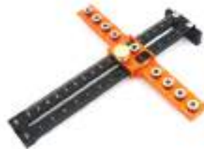
Whisky Jack Deluxe Cabinet Drilling Jig Reg. $59.95