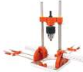
Whisky Jack Precision Multi-Angle Drill Guide Reg. $199.95