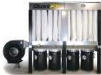
DustFX Max-4600 Dust Collector