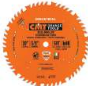
CMT Carbide Combination Saw Blades Reg. Price: From $98.95 Sale: $89.95