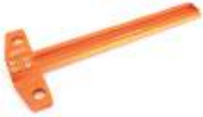
Whisky Jack 12" Scribing T-Square Reg. $19.95 Sale: $53.96