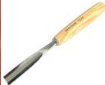
Pfeil 7/20 Straight Gouge Reg. Price: $65.95 Sale: $44.95