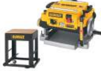
DeWalt 13" Planer with Stand