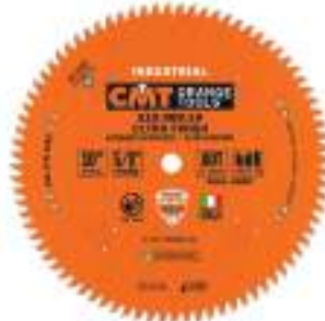
CMT Carbide Fine Cut Miter/Radial Arm Saw Blades Reg. Price: $139.95 Sale: $126.95