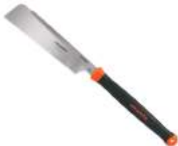
Jorgensen 9.5" Pro Dozuki Dovetail Pull Saw