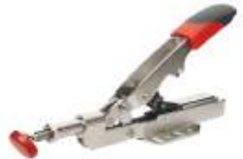
Armor Auto-Adjust In-Line Toggle Clamp Reg. Price: $49.95