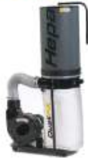
DustFX 1 HP Hepa Dust Collector Reg. Price: $899.95 Sale: $779.95