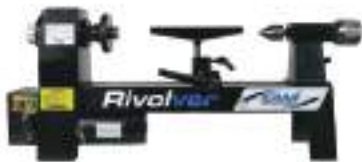
Rivolver 8" x 12" Vari-Speed Wood Lathe