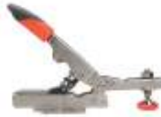
Armor Auto-Adjust Hold Down Toggle Clamp Reg. Price: $49.95