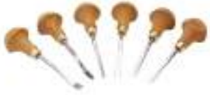
Pfeil "A" 6 PCS Detail Palm Chisel Set