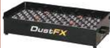
DustFX Bench Top Down Draft Table