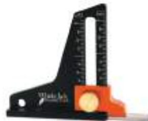
Whisky Jack Precision Height Gauge