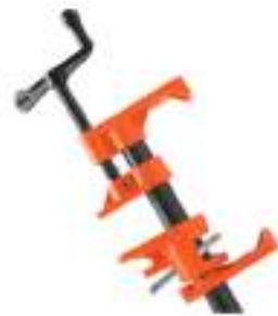
Pony 3/4" "Pro" Pipe Clamp with Built-in Stand