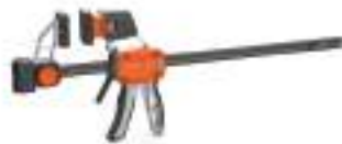
Jorgensen HD Platinum Series Aluminum Spreader Clamp