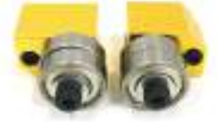
Stallion Lower Ball Bearing Guide Set Reg. Price: $44.95 Sale: $39.95

Clearance Deals are Exempt from Free Shipping