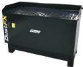
DustFX Deluxe Hepa Down Draft Table