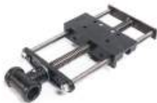
Beaver Quick Release 7" Front Vise Reg. Price: $169.95 Sale: $159.95