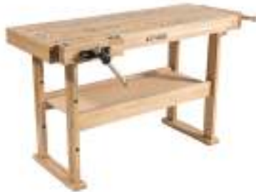
Beaver "Hobby XL" Workbench c/w 2 Vises Reg. Price: $849.95 Sale: $799.95